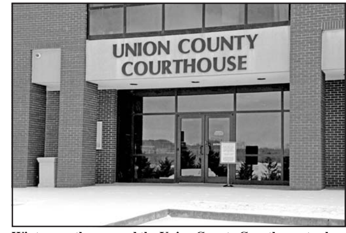
Winter weather caused the Union County Courthouse to close on Wednesday, Jan. 17, and it opened again on Thursday, Jan. 18, at 10 a.m.